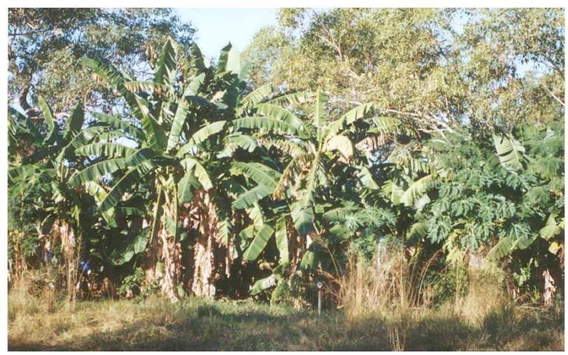
Figure 11. Banana and fruit tree orchard at Birdwood Downs benefit from greywater from septic tank leachdrains – a simple form of subsoil wastewater irrigation. Bananas are planted in leachdrain filled with gravel and adjoining lines receive nutrients and water from the septic tank discharge.

bananas, plantains, papaw (papaya) and guava trees. The leachdrains were lined with gravel to prevent any surface exposure or odour of the discharge wastewater and bananas planted in it, as well as leachdrain water supplying water and nutrients to the lines of banana nearby.