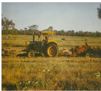
Figure 1. (Left) Aerial view of Birdwood Downs circa 1985 showing, lighter colour, portions of the property which were cleared of invasive scrub trees and planted to improved pasture. (middle) Stock grazing on improved pasture grasses and legumes. (Right) Hay-making on regenerative pasture land.