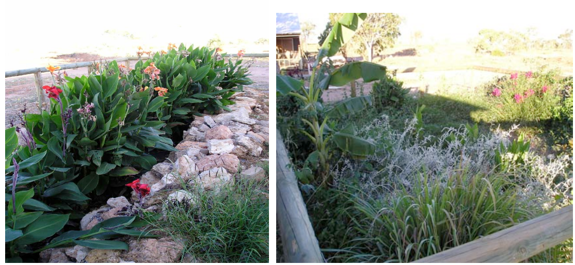
Figure 16. (left) Wastewater Garden for individual house, Joy Springs community, Fitzroy Crossing, West Australia. (Right) one of 80m2 raised inverted leachdrains serving as backyard gardens.

In 2004, four low-lying houses at the Joy Springs (Eight Mile) Community east of Fitzroy Crossing, West Australia were retrofitted with Wastewater Gardens, gravity-flow leachdrains and submersible pumps to get wet season effluent from the Wastewater Gardens to an inverted leachdrain area built 0.5m above ground level (Figure 16). The systems were fenced with wooden bollards and wire mesh to prevent children from playing in the gardens, and to exclude grazing livestock. The inverted leachdrains, just at the back of each house, was also planted with native bushtucker and medicinal plants, as well as fruit trees and decorative flowering shrubs. A supplemental drip irrigation system on a timer was installed to ensure adequate irrigation of the garden which benefits from wastewater nutrients when pumps are required during the wet season. A fifth house at the community on higher ground had a simple Wastewater Garden with gravity-flow leachdrain area since its soils do not get saturated during the wet season.