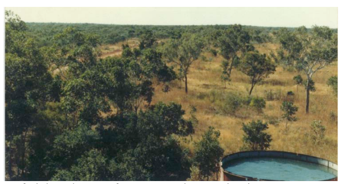
Figure 3. View of Birdwood Downs from water tank tower showing tree cover on sand dune caps and groves of trees.

Our major challenges were to keep invasive woody weeds from regrowing and overtaking the improved pasture. Deciding against the use of broad-scale herbicides as expensive and dangerous for people and the environment, we followed initial D-4 clearing and stick-raking/burning of windrows, with hand removal using adzes. "Wattle chopping" at first seemed an almost impossible task since Acacia seeds can number 20,000 per hectare, and have a long life (20-25 year viability) till their hard seeds are activated by bushfire. But with time, we began to beat the seed-bank to where most of the thousand acres (400 hectares) of prime improved pasture at Birdwood Downs is kept under wattle control with just 0.5-1 hour labour per hectare. Pastures are "wattle-chopped" either once or twice per year depending on labour availability on the station. In the process, staff get a ground-truth view of the health of the pastures and other invasive species (such as South Australian mint, Sida acuta, Calytrix spp.) can also be dealt with.