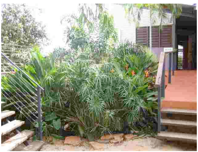
Figure 15. Courtyard Wastewater Garden, centred between family house and guest rooms at Coco Eco B&B, Coconut Well, Broome, W.A. creates a lush tropical garden without use of machinery, electricity nor chemicals at the facility.

In 2004, four low-lying houses at the Joy Springs (Eight Mile) Community east of Fitzroy Crossing, West Australia were retrofitted with Wastewater Gardens, gravity-flow leachdrains and submersible pumps to get wet season effluent from the Wastewater Gardens to an inverted leachdrain area built 0.5m above ground level (Figure 16). The systems were fenced with wooden bollards and wire mesh to prevent children from playing in the gardens, and to exclude grazing livestock. The inverted leachdrains, just at the back of each house, was also planted with native bushtucker and medicinal plants, as well as fruit trees and decorative flowering shrubs. A supplemental drip irrigation system on a timer was installed to ensure adequate irrigation of the garden which benefits from wastewater nutrients when pumps are required during the wet season. A fifth house at the community on higher ground had a simple Wastewater Garden with gravity-flow leachdrain area since its soils do not get saturated during the wet season.