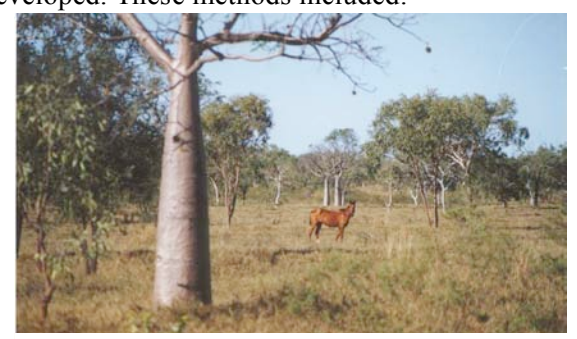
Figure 2. Regenerated pasture with native trees including Boabs and groves of trees.

In the course of this environmental experimentation, methods of minimizing soil erosion and regeneration techniques appropriate to the challenging conditions of the Kimberley region were developed. These methods included: