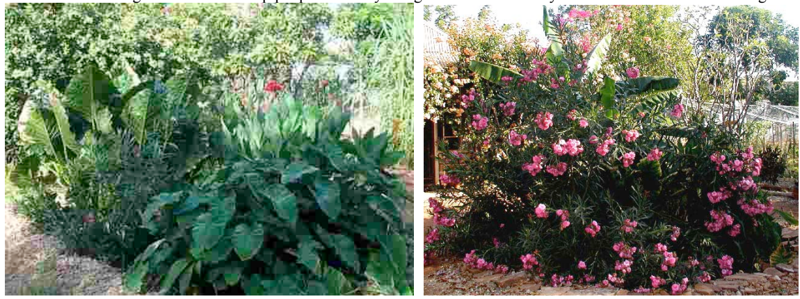
Figure 13. (left) Wastewater Garden serving homestead at Birdwood Downs one year after planting, April, 2001 (right) system after two years of growth. The system now has abundant canna lilies, Heliconia (Bird of Paradise) and oleander flowers as well as supporting banana, coconut, elephant ear, papyrus and pandanus palm.

In the past four years, additional Wastewater Gardens have been installed at two Kimberley indigenous communities and at an ecologically-oriented family house and bed and breakfast in the Broome area.