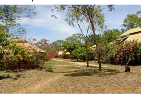
Figure 6. Bungalows for staff and tourists built with local rock, double-vented roofs and louvered windows for cooling; and savannah ecoscaped.

The Birdwood Downs' homestead buildings, designed by the Institute of Ecotechnics, use local regional resources (Kimberley colourstone rock), double-vented roofs for natural ventilation, and the use of screened verandahs and louvered windows in place of expensive and energy-consumptive air-conditioning. In 2004, Birdwood Downs installed a solar electric system to increase its value as an ecological demonstration of sustainable environmental practice in the Kimberley, reducing by over 90% its reliance on generators and fossils fuels.