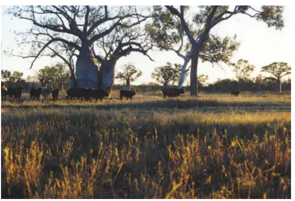
Figure 5. Improved pastures have led to dramatic increase in carrying capacity and year-round weight gains and health of animals on these previously overgrazed and degraded coastal pindan soils.