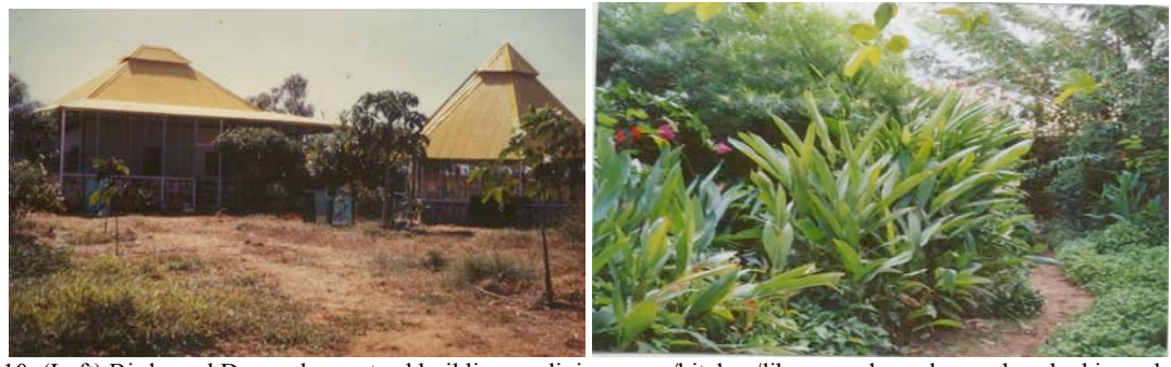
Figure 10. (Left) Birdwood Downs homestead buildings – dining room/kitchen/library and gazebo garden shed in early 1980s. (Right) Photographs taken from the same spot showing the "savannah ecoscaping" which has transformed the Birdwood Downs homestead, creating an oasis of shade, beauty and diversity.

The homestead area of Birdwood Downs has been enriched with special micro-climate improving gardens, orchards and silviculture to complement the architecture and demonstrate the beauty and comfort of living in the Kimberley. This approach, using native plants and vegetation adapted to the Kimberley is called "Savannah Ecoscaping" and has been extended by Birdwood Downs to demonstrate greening of Aboriginal communities (e.g. Looma), public buildings (the Derby Youth Centre) and mining company operations and area restoration (the Derby Export facility and tailings dams at Pillara and Cadjebut near Fitzroy Crossing). Savannah Ecoscaping can be designed for the water availability, either using the natural cycles of the wet season, arid zone style irrigation, or using the recycling of greywater. Soil building to provide the conditions necessary for the establishment of the ecoscaping is also part of the process.