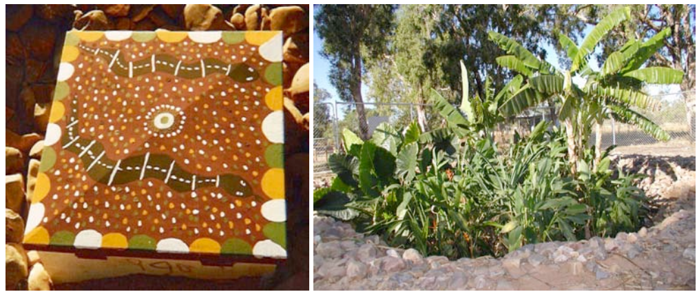
Figure 14. Emu Creek (Gulgagulganeng) community, Kununurra, W.A. artists painted dreamtime stories on the Wastewater Garden control boxes (right)/ One of decentralized systems at the community treating residential sewage and featuring canna lilies, heliconia (Bird of Paradise), palms and banana trees (left).

Two years of quarterly water quality tests at these first two Kimberley region Wastewater Gardens showed that effluent water was reduced 89-95% reduction in BOD (a measure of organics in the water), 90-95% in suspended solids, 30-58% in total phosphorus and 48-73% reduced in total nitrogen. Fecal coliform was reduced over 98% without disinfection, but since wastewater is kept away from surface exposure at all stages, there is little danger of accidental human contact (Nelson and Tredwell, 2002).